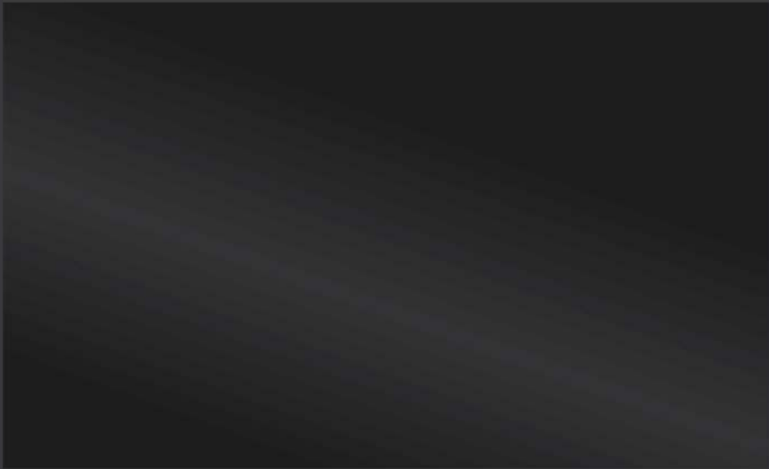
3M Color Stable Automotive Window Films