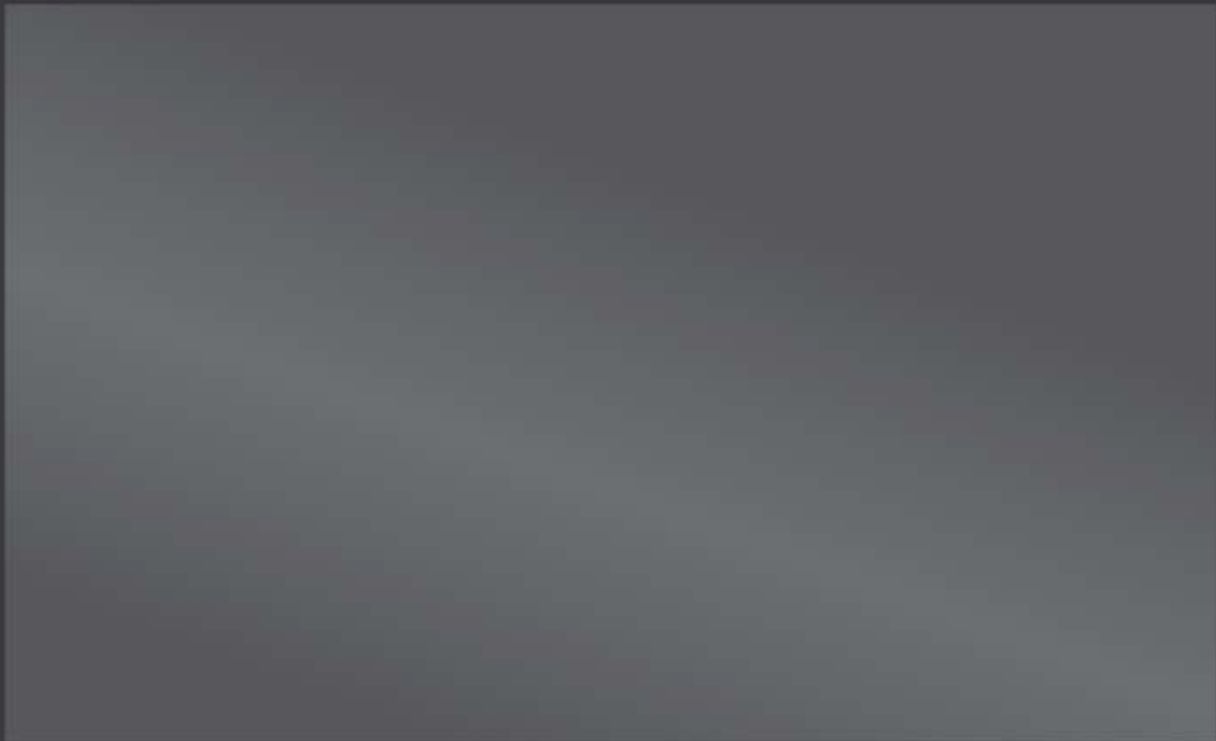
3M Color Stable Automotive Window Films