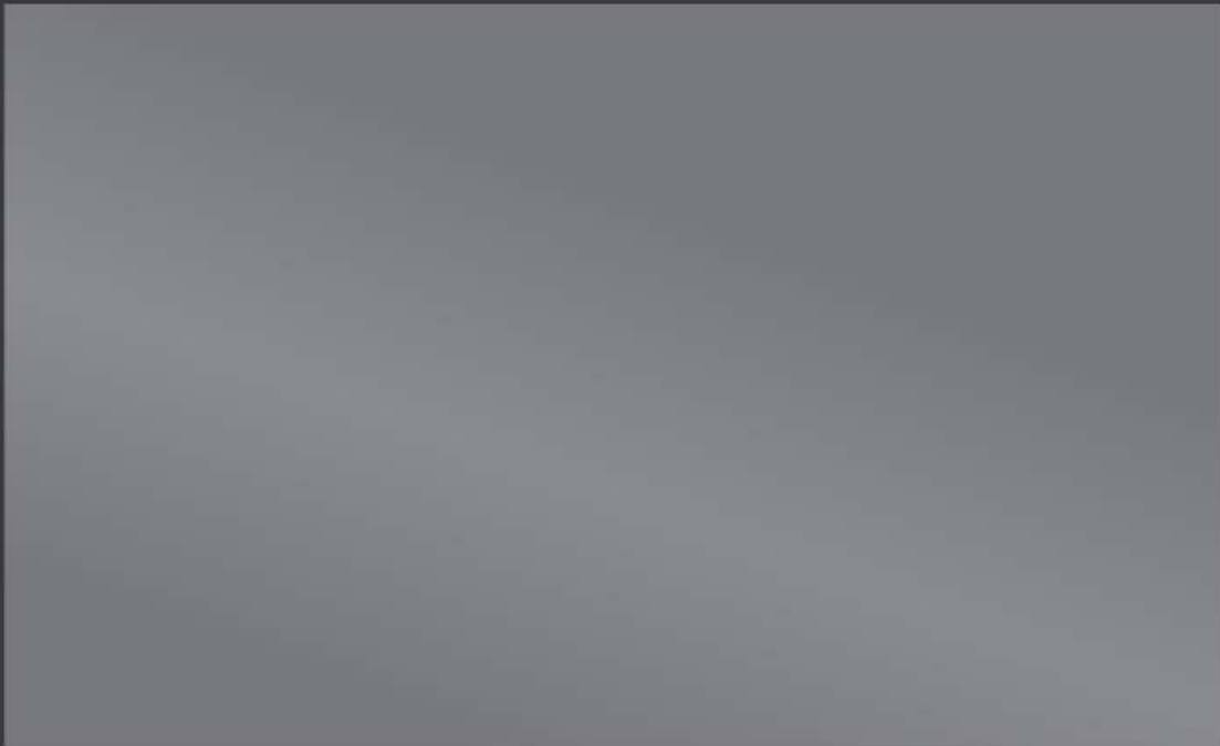
3M Color Stable Automotive Window Films